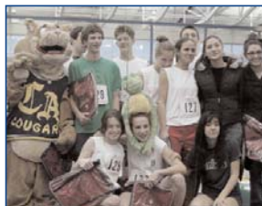
Centennial Academy's Splash and Dash teams, with some help from Cool Cat, merit the school spirit award